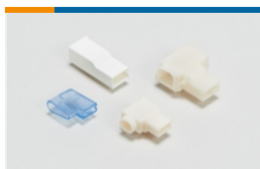
Crimp Terminal Housings(3)